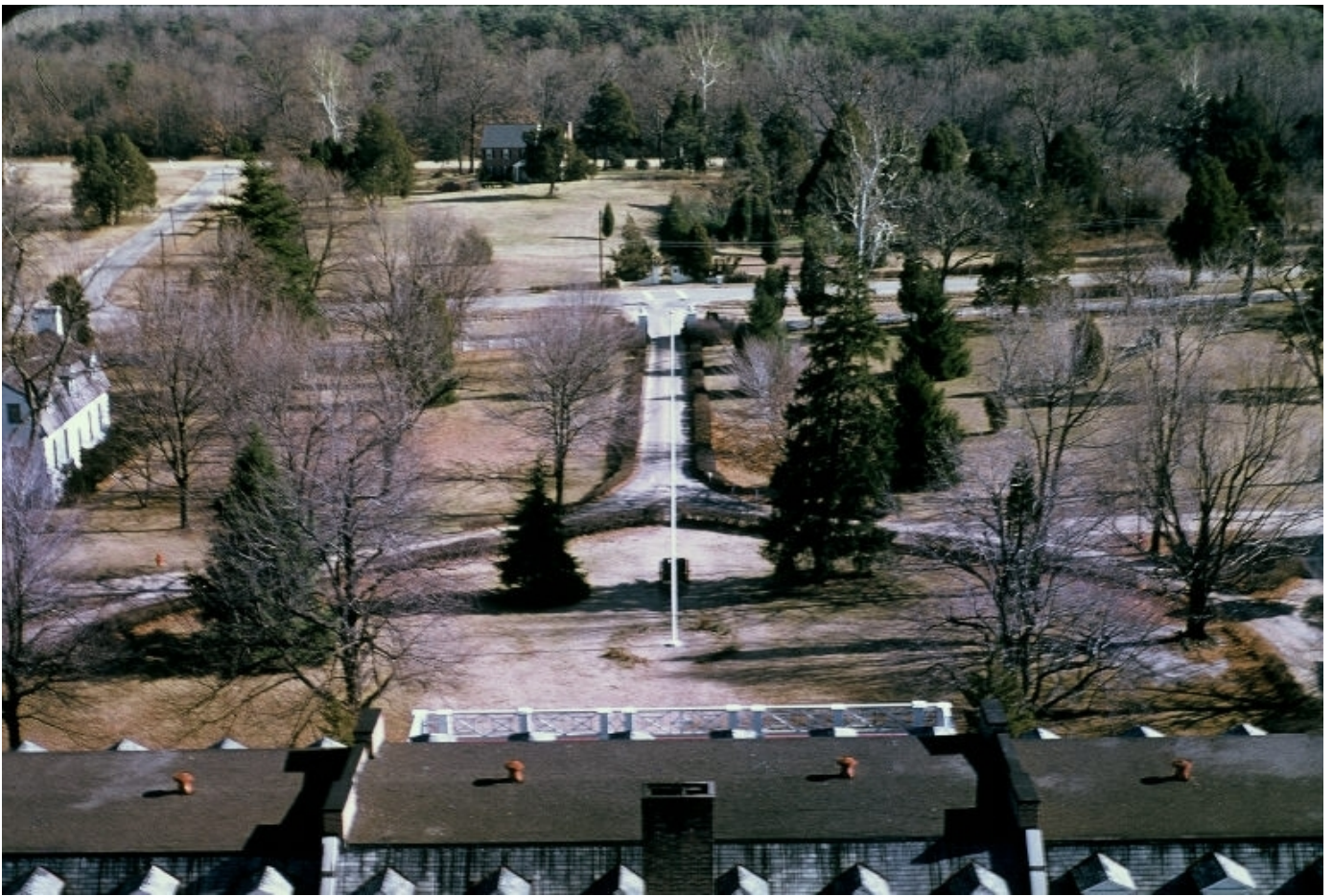
CHMA Water Tower – Main Campus, Headmaster House (background)