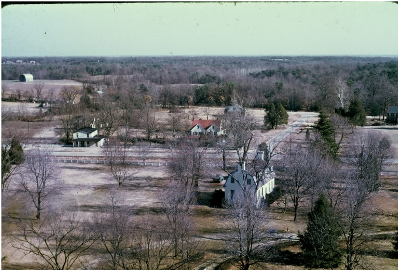
CHMA Water Tower – White House, Post Office, Charlotte Hall Road