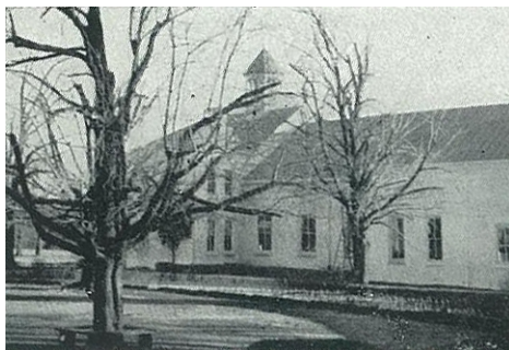
School Hall 1946