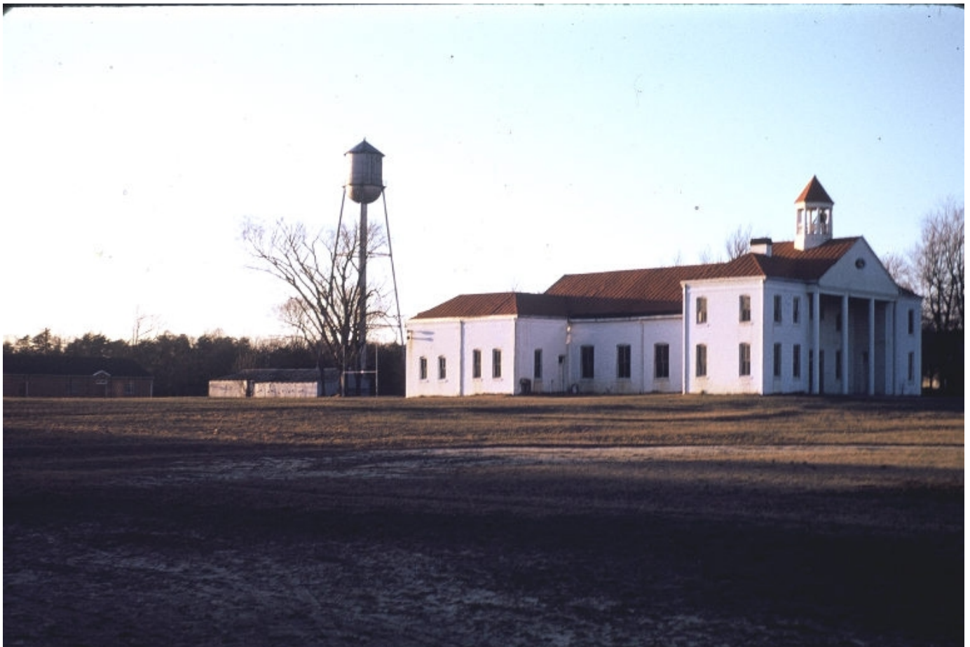
CHMA School Hall East Side