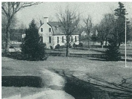
White House 1946