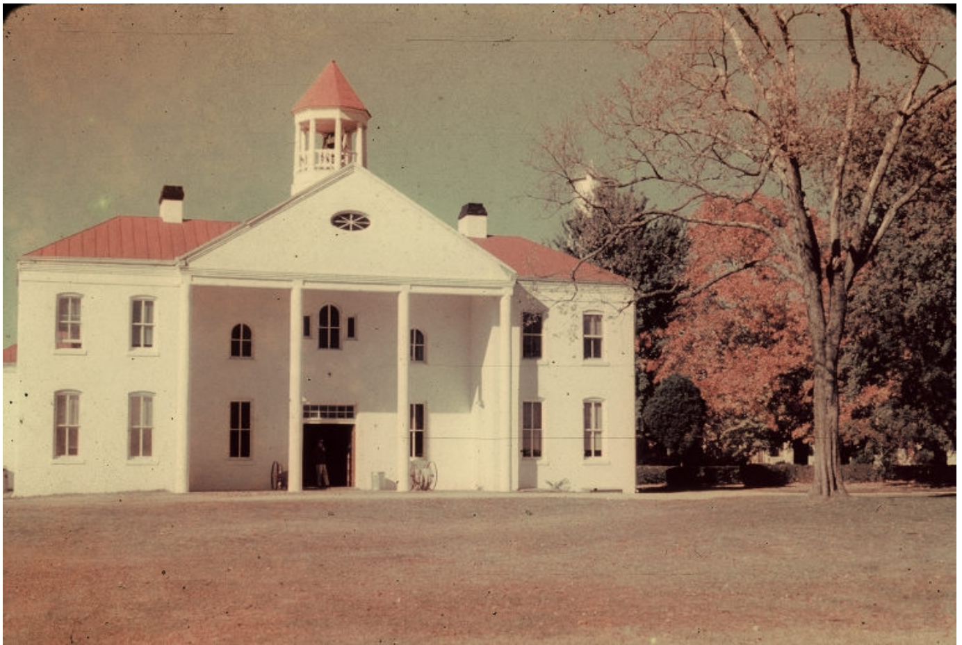
CHMA School Hall Front