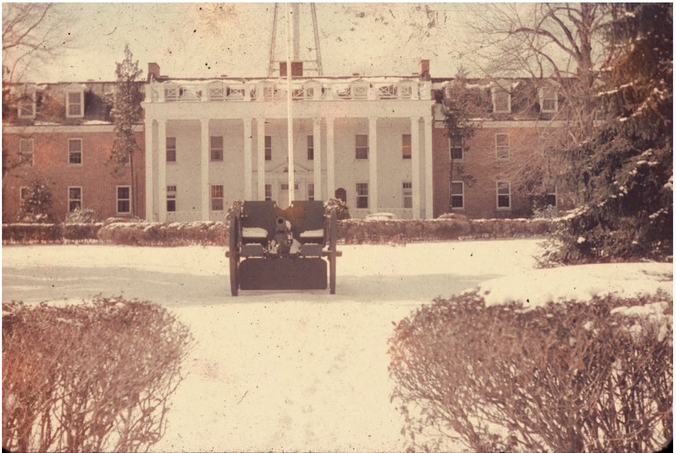
CHMA Main Building