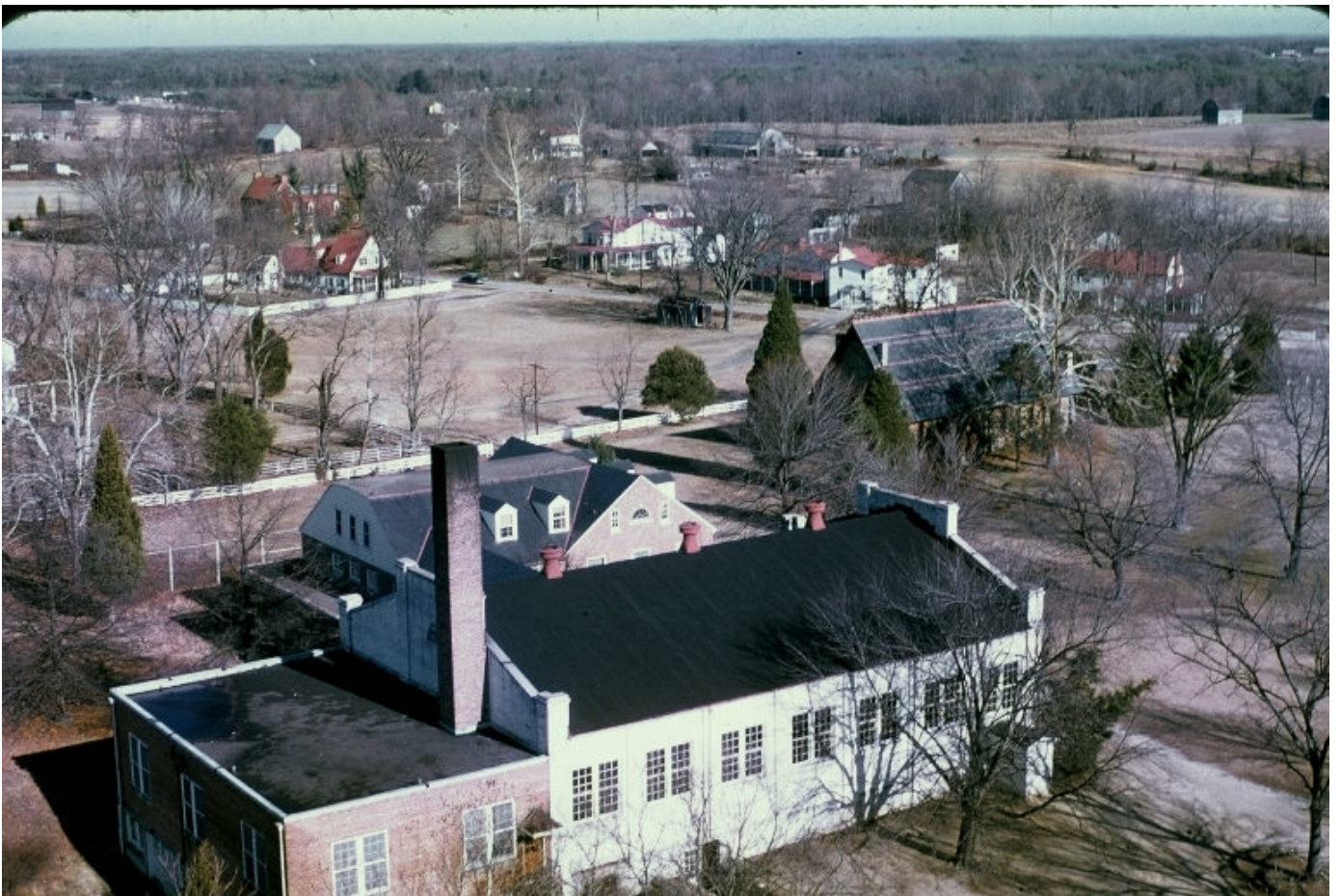
CHMA Water Tower – Gym, Keech Hall, Dent Chapel, Faculty Residences