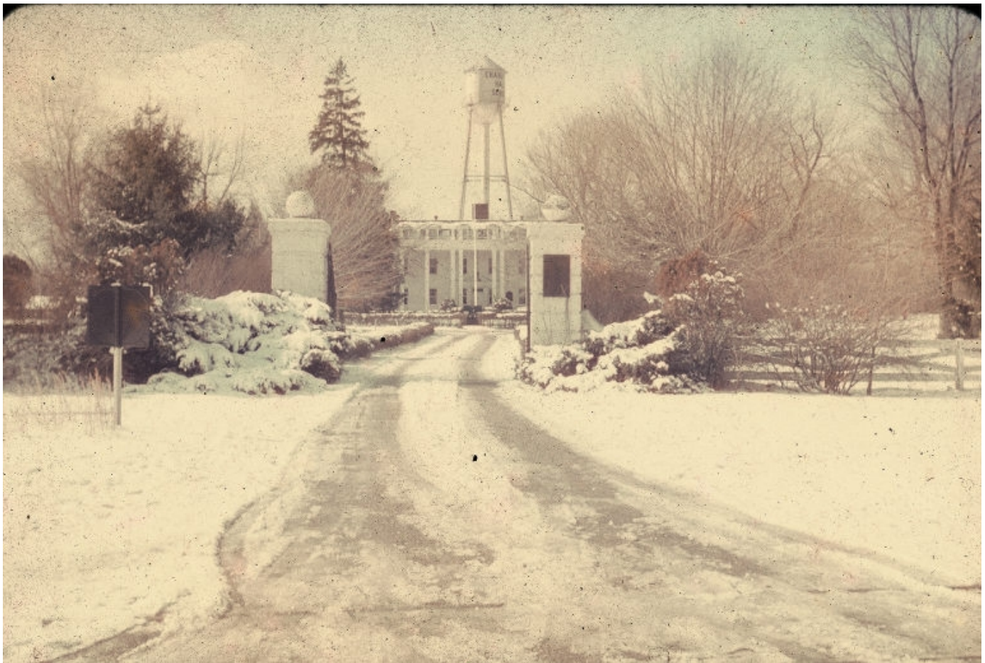
CHMA Main Entrance