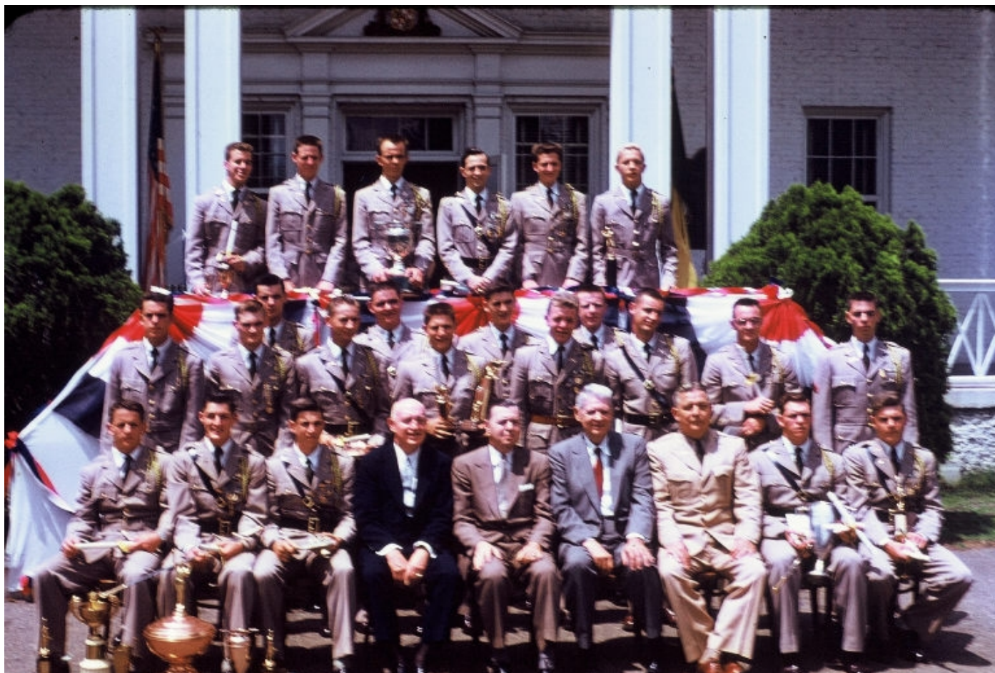
1952 Graduation Class